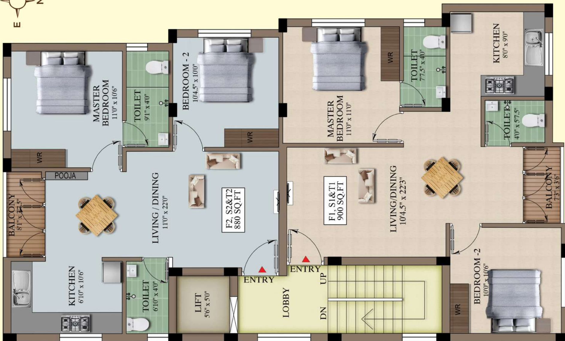
TYPICAL FLOOR PLAN (FIRST, SECOND & THIRD)

— RKV AVENUE 5TH STREET-20FT WIDE ROAD —